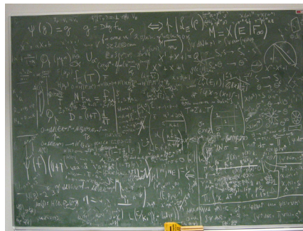
There, now that we understand women. We can move on to our next subject, Quantum shit.

Advertising inquiries, questions & comments should be directed to bull@mtu.edu