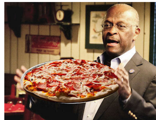
Nine. Nine. Nine dollar nine inch! Cheezy! I'm Herman CAIN.